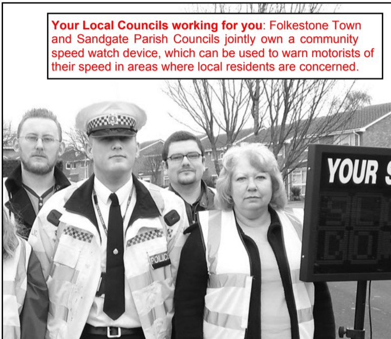
Your Local Councils working for you: Folkestone Town and Sandgate Parish Councils jointly own a community speed watch device, which can be used to warn motorists of their speed in areas where local residents are concerned.

Sandgate Parish Council also set a zero rise for the new year.