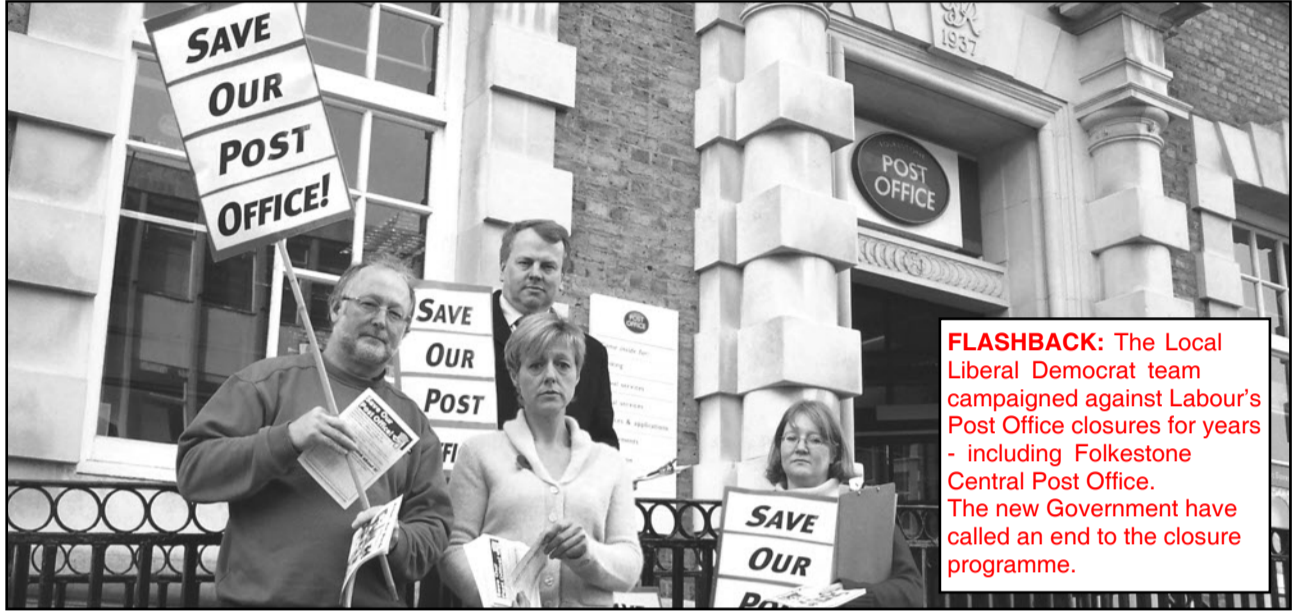
FLASHBACK: The Local Liberal Democrat team campaigned against Labour's Post Office closures for years - including Folkestone Central Post Office. The new Government have called an end to the closure programme.

Post Office branches will be helped to offer more banking and local Council services to make them more viable.