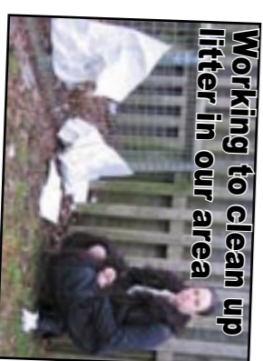
Working to clean up litter in our area