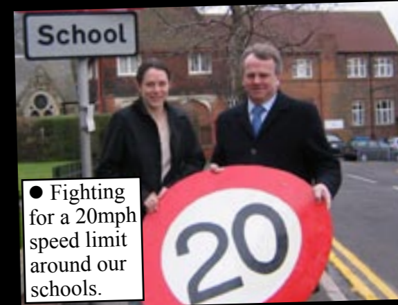
● Fighting for a 20mph speed limit around our schools.