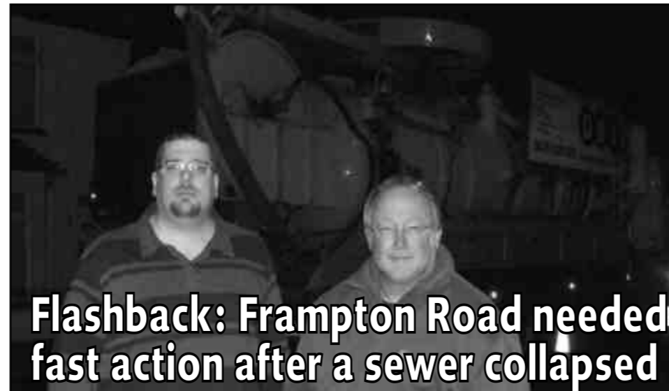
Flashback: Frampton Road needed fast action after a sewer collapsed

"This is the sort of action that needs local people on the ground. Local residents needed us on site to help sort the problem."