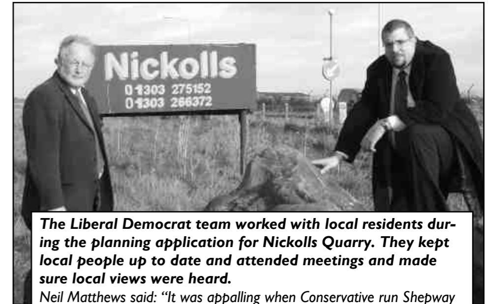
The Liberal Democrat team worked with local residents during the planning application for Nickolls Quarry. They kept local people up to date and attended meetings and made sure local views were heard.